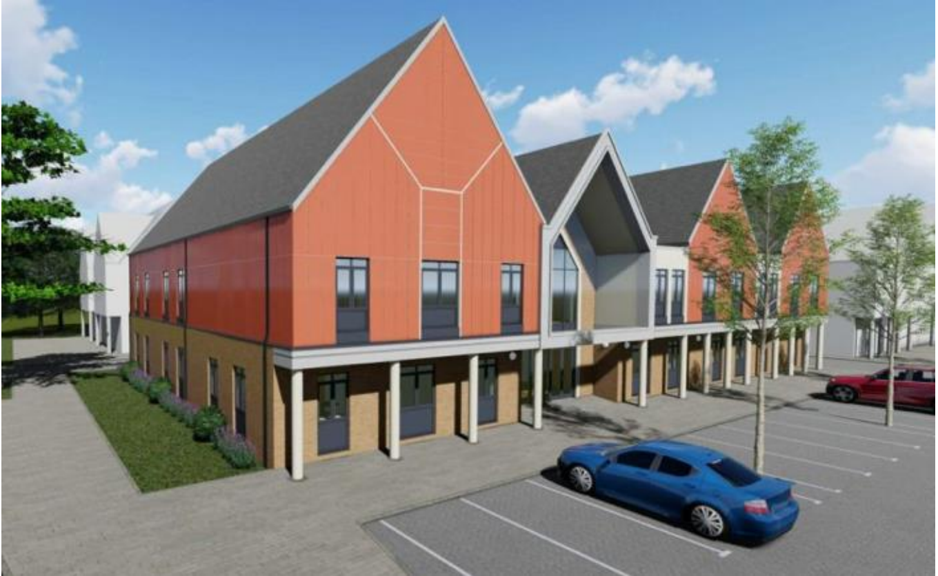
3D render of the Beaulieu Healthcare Centre

Hutton Construction have been appointed by Countryside and L&Q to construct the Beaulieu Health Centre at Beaulieu Square Neighbourhood Centre, Beaulieu. The new Health Centre will be located next to the Beaulieu Community Centre.