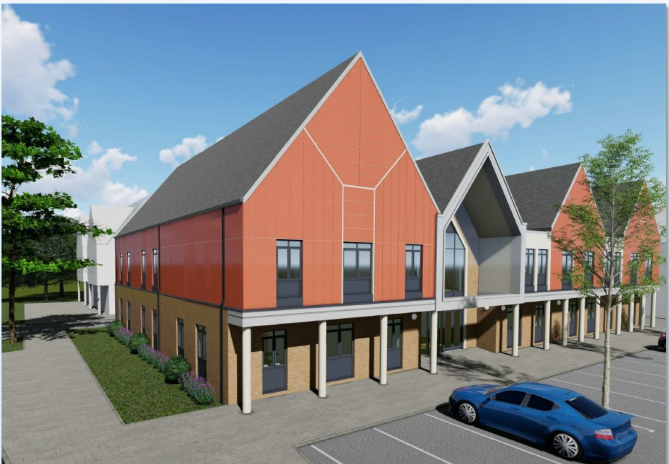
CGI of Health Centre

Once opened the transition of services from Mountbatten House Surgery to the new Beaulieu Health Centre will begin, with all patients gradually being moved to the new site.