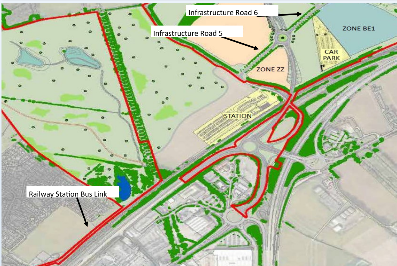
Extract of latest Beaulieu Masterplan showing the layout of the station road infrastructure.