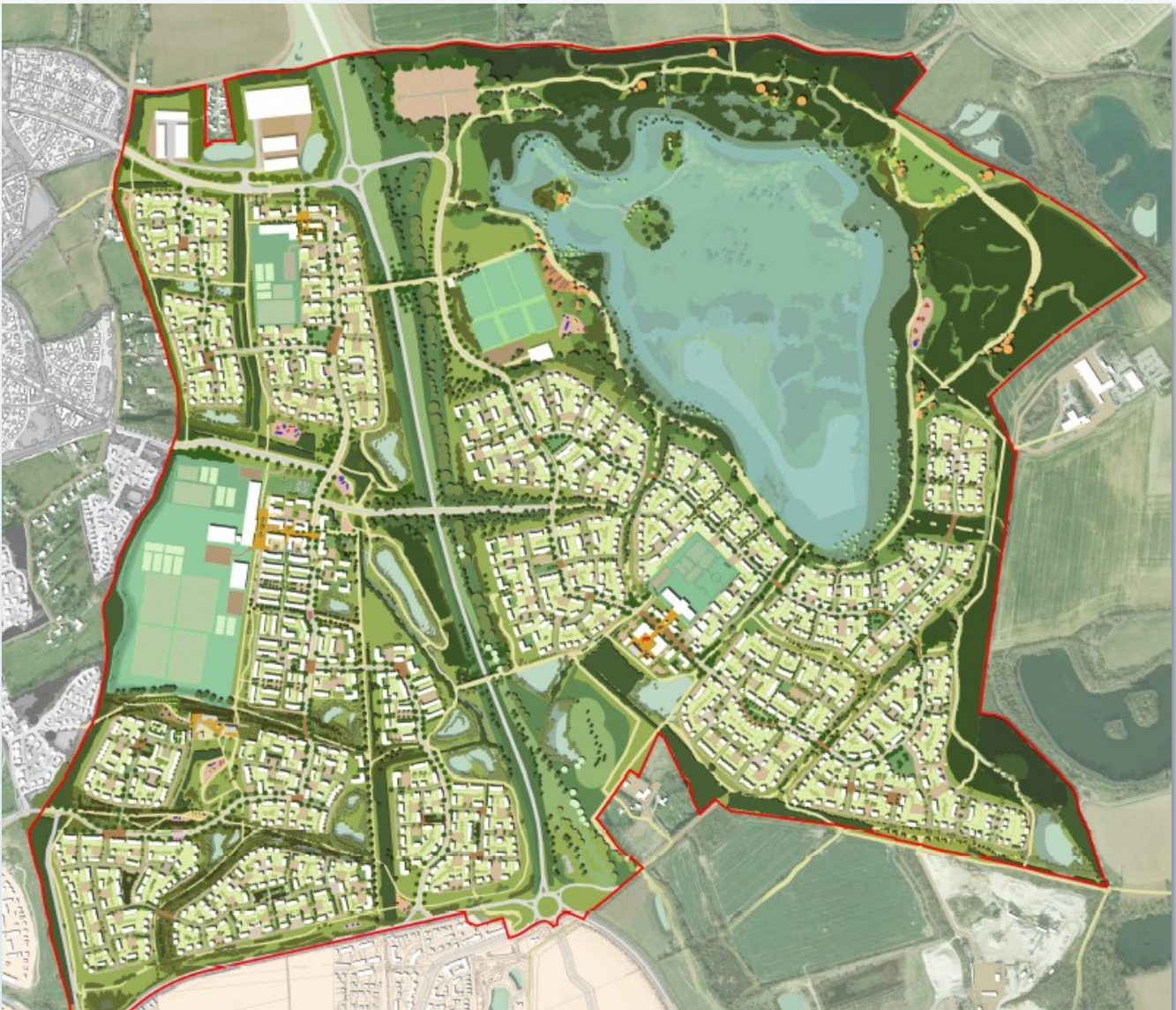
Illustrative Masterplan submitted for Zone 2, with Beaulieu to the south.

The new community will be delivered around three new villages, providing local services including three primary schools and one secondary school, nursery provision, medical center, village hall and flexible employment floorspace. These proposals form part of the wider Garden Community being delivered by a Development Consortium totaling 6250 dwellings plus other key land uses