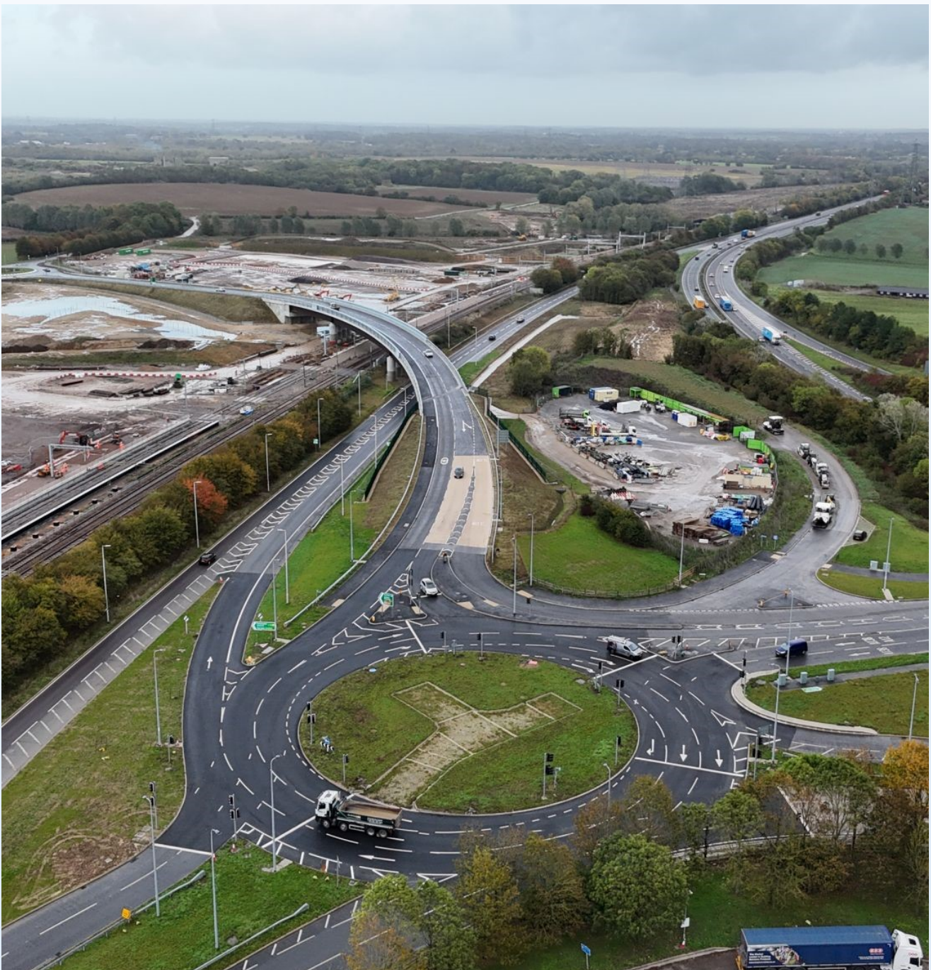
Photograph of Beaulieu Parkway Bridge completed

Following the opening of the Radial Distributor Road (RDR) Phase 2 in 2021, the Phase 3 Bridge is now complete and was opened to traffic on the 30th October 2023. This marks the final phase of a £35 million infrastructure programme by Countryside and L&Q to deliver a new relief road linking Essex Regiment Way and Boreham Interchange and provides more convenient access to new homes and services in Beaulieu as well as the future Beaulieu Park Station.