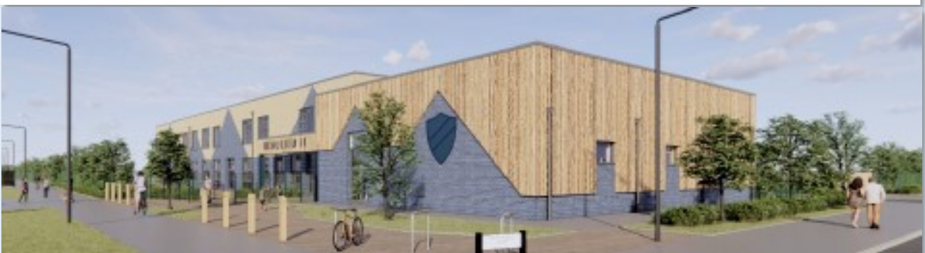
Proposed North-West Elevation of approved primary school

An application (ref. 23/00028/CM) was approved by Essex County Council in April 2023 for the second primary school in Beaulieu located off New Hall Way. The school is proposed to be open in September 2024 and Countryside have transferred the fully serviced site to Essex County Council who are delivering the school.