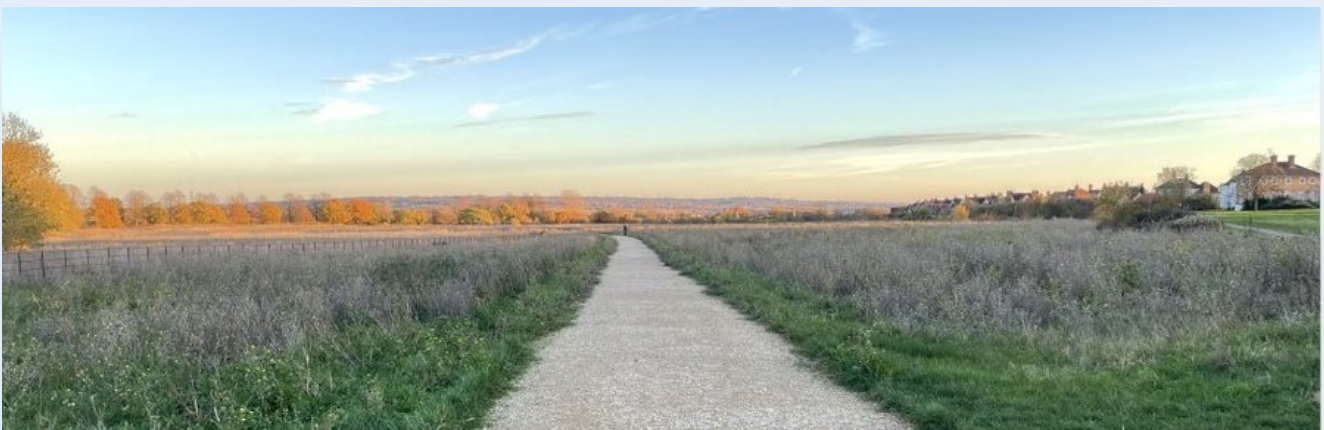
Photograph of the Deer Park

The Deer Park located to the south of New Hall, has established its part within Beaulieu and is a key part of the wider public open space enhancements. The paths have been designed to allow for local residents to walk, cycle and/or run through an area that is rich in biodiversity and heritage value. These paths extend around the edge of the Estate Parkland and through the Public Parkland.