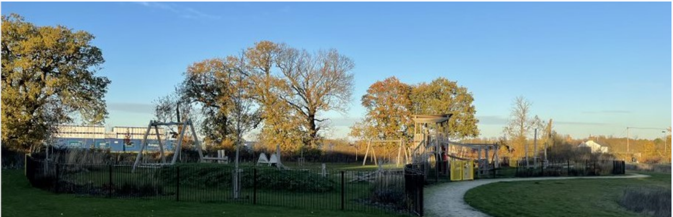
Photograph of the newly opened playground in Northern Meadows

This landscaped area is now fully open for residents to use, with the final addition to the area being the opening of the playground.